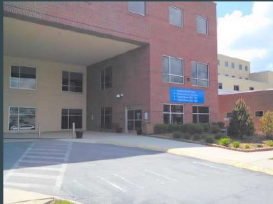
Covenant/Cumberland Medical Center conference rooms entrance.