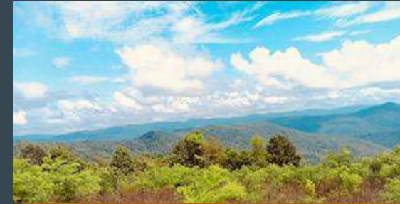
Above: Lawson Mountain Overlook Below: McGill Creek