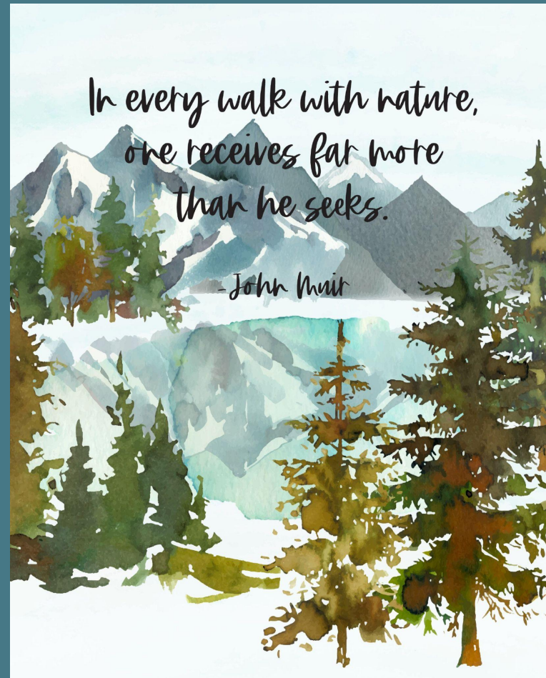
Cumberland Forest Friends enjoying Black Mountain